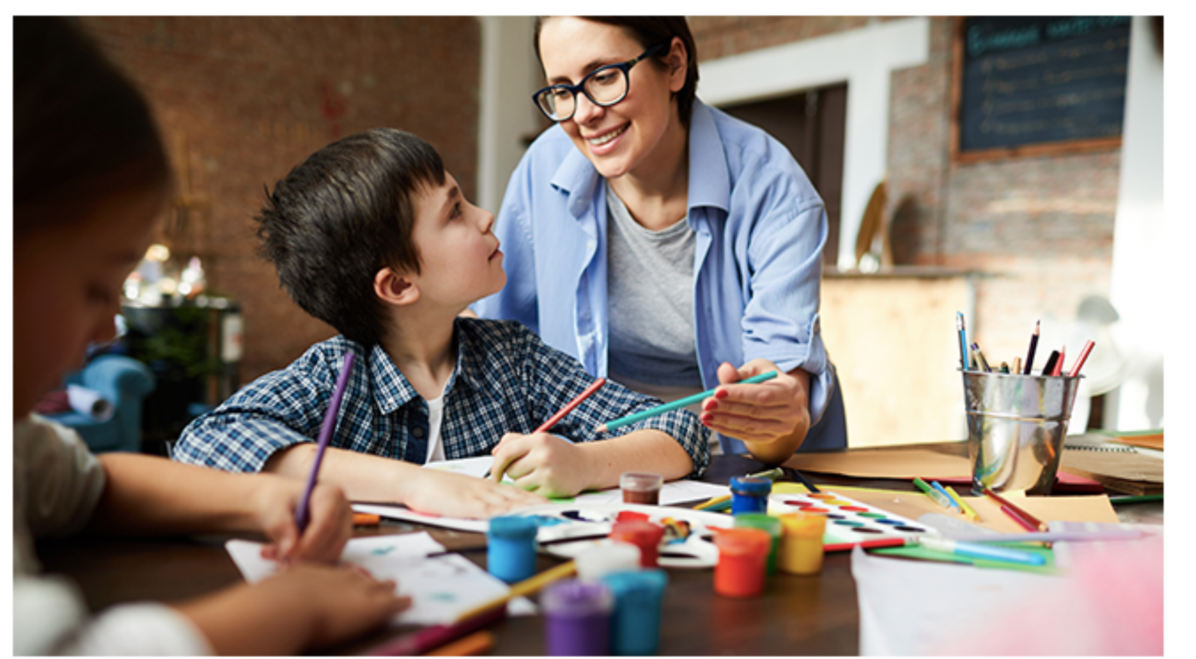
Addressing the educational needs of children in foster care www.umassmed.edu/faces