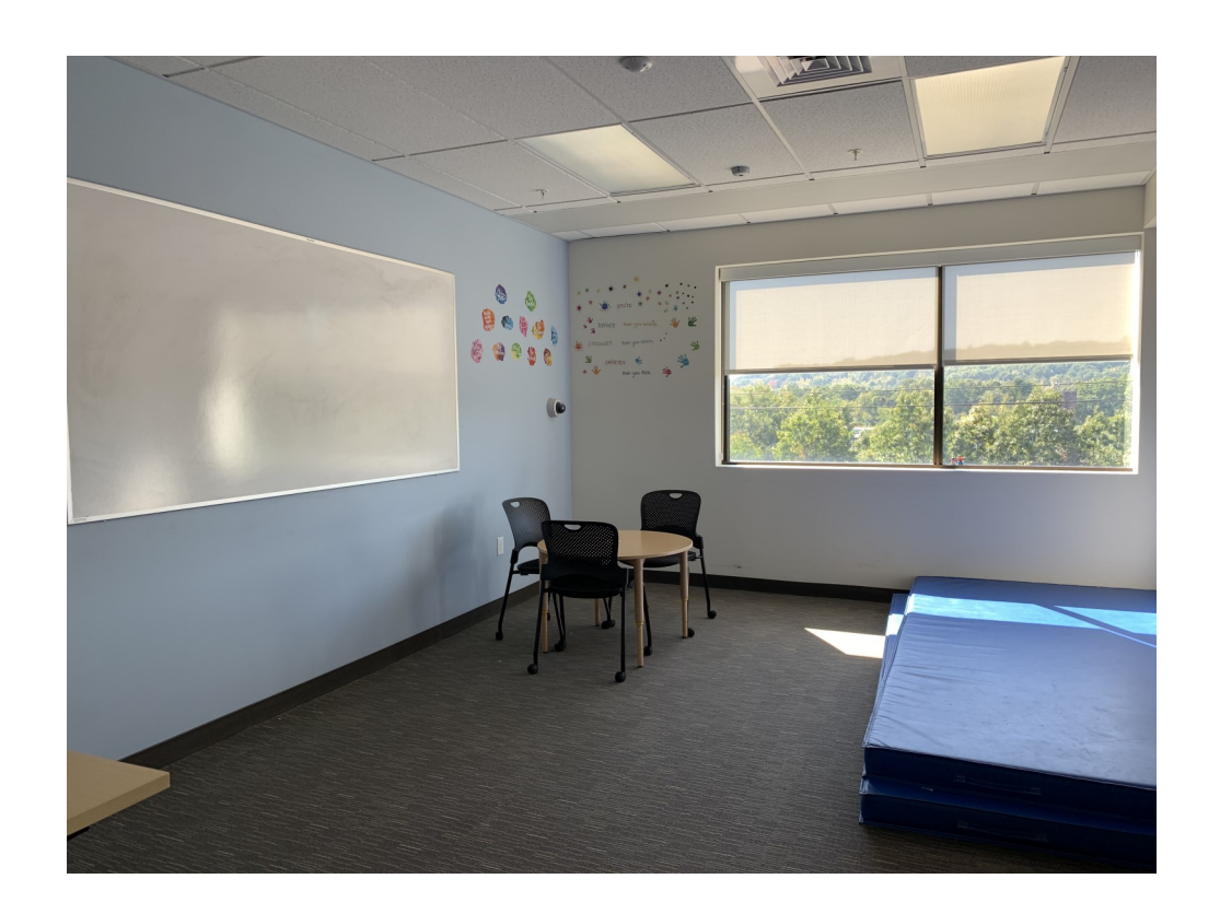
You will come into this room to talk, draw and play.